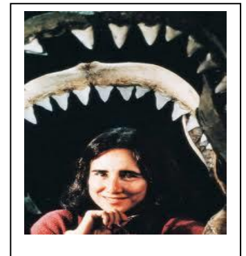
This is Eugenie Clark