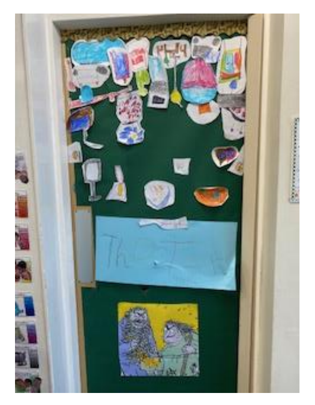
The Twits – Roald Dahl