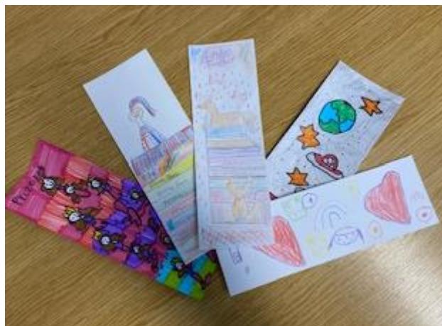
The winning bookmarks. Well done!