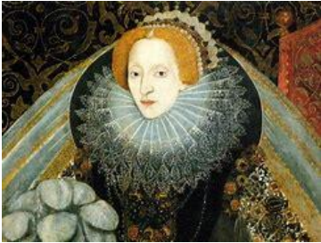
Queen Elizabeth I

They have started talking about Queens of England in History and learning what the word 'monarchy' means. In Computing they have been talking about keeping safe on the internet.